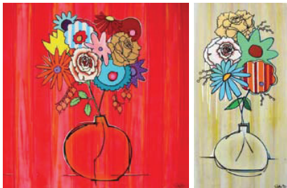
Les Galerie d'art Beauchamp - The Beauchamp Art Galleries