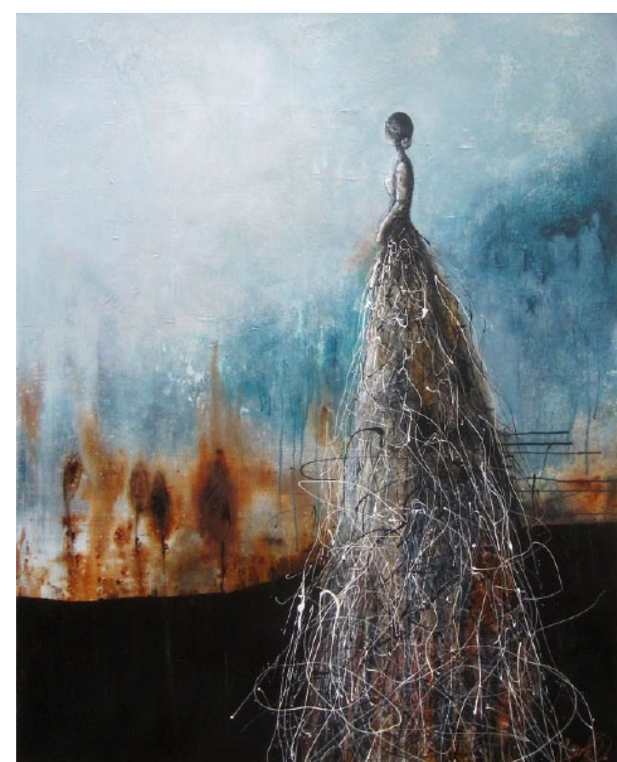
Léanie :: 60 x 48 in

This self-taught artist has been exploring the reactions between acrylics with water, and alcohol along with other mixed media techniques. Favouring the human form, Campo creates pure forms and atmospheres through diluted rather than saturated colours. Her works are characterized by a subtle, timeless and dreamlike representations. This new artist is yours to discover at Galerie Beauchamp, situated at 50 Rue Notre-Dame.