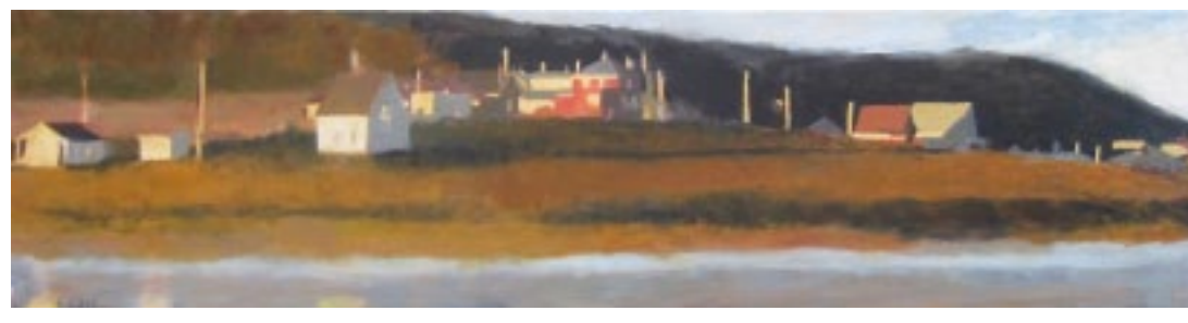
Intimacy :: 12 x 48 in