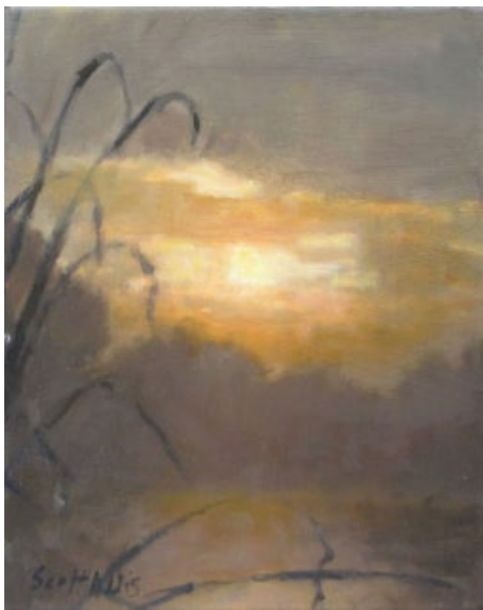
Kingston morning :: 10 x 8 in