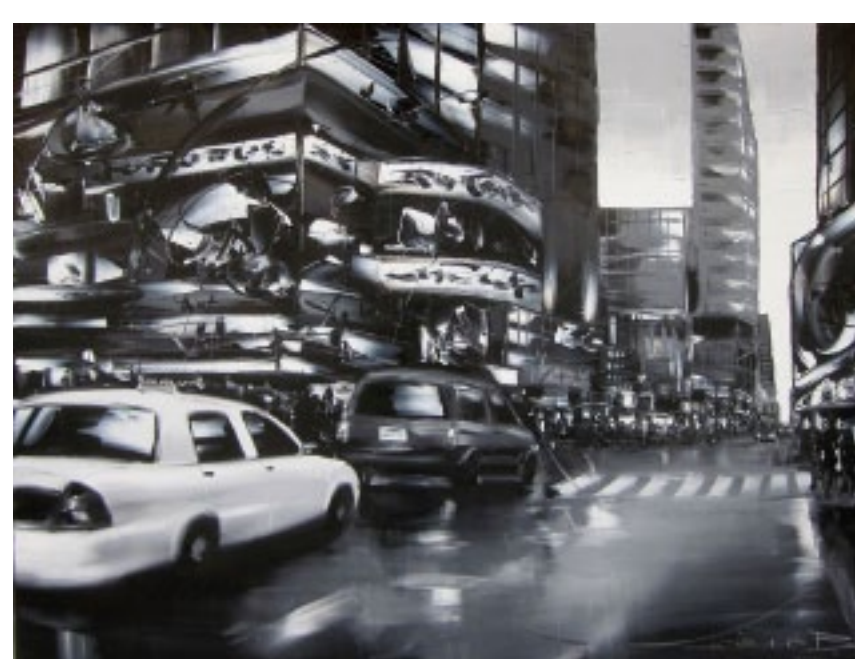
Blouin :: Leaving for the city :: 36 x 48 in

Joëlle Blouin's work is permanently on display at Beauchamp Contemporain, situated at 9 Rue St-Pierre.