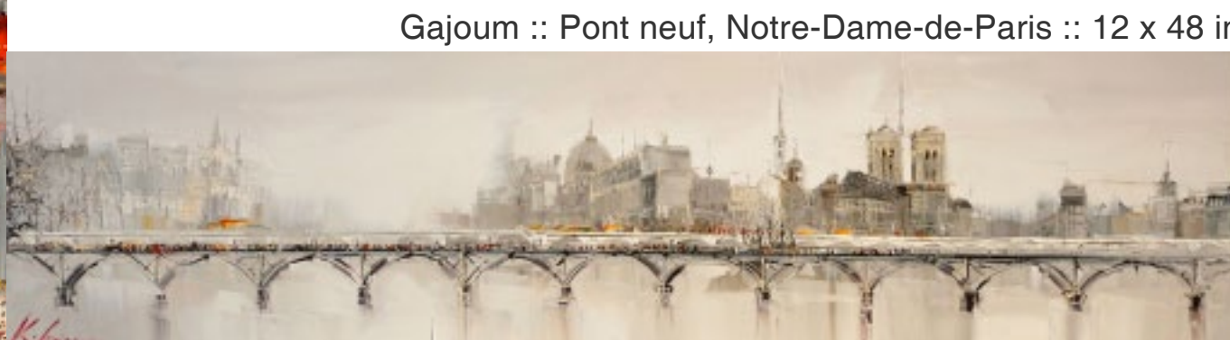
Gajoum :: Pont neuf, Notre-Dame-de-Paris :: 12 x 48 in

New works by artist Kal Gajoum can be viewed in Galerie Espace B8. From November 25 to December 30 2011, discover the fascinating universe of Kal Gajoum. His works will reveal the beauty of the greatest urban centres, and the undeniable talent of a one-of-a-kind artist.