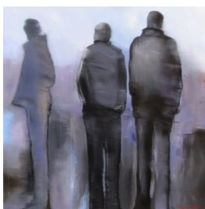
Decisions taken :: 48 x 48 in