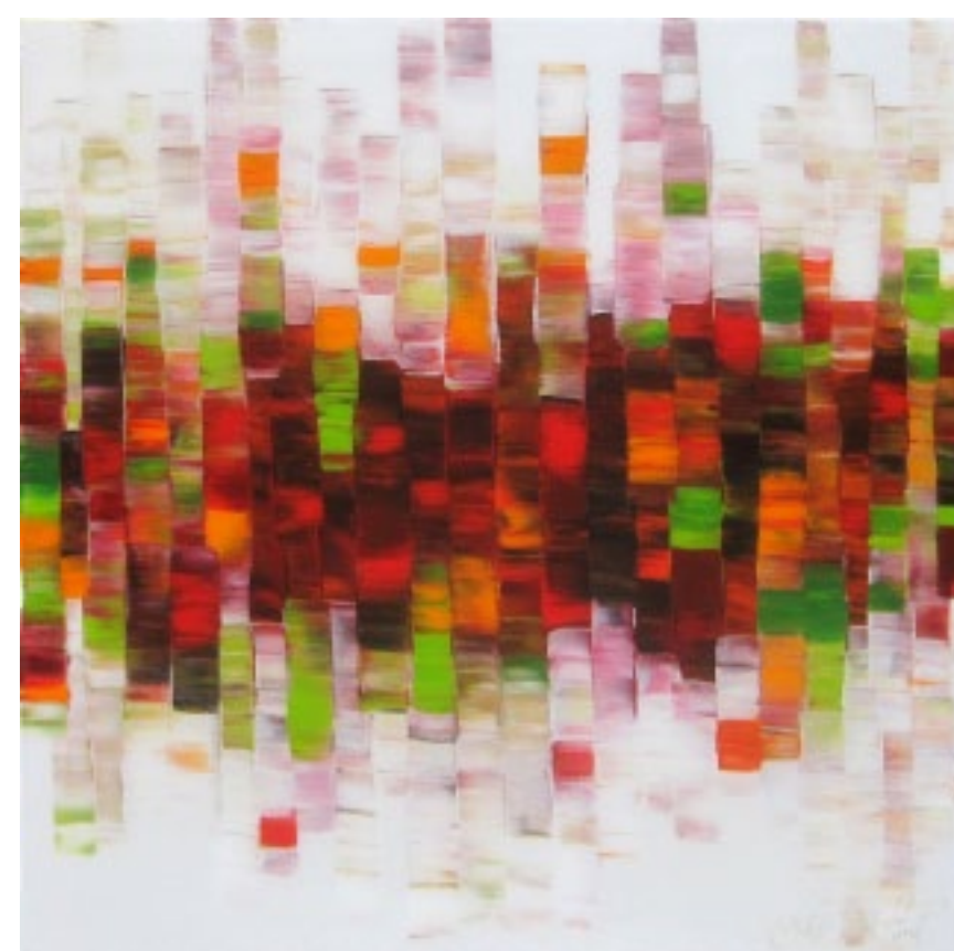
Au contour de la nature :: 30 x 30 in