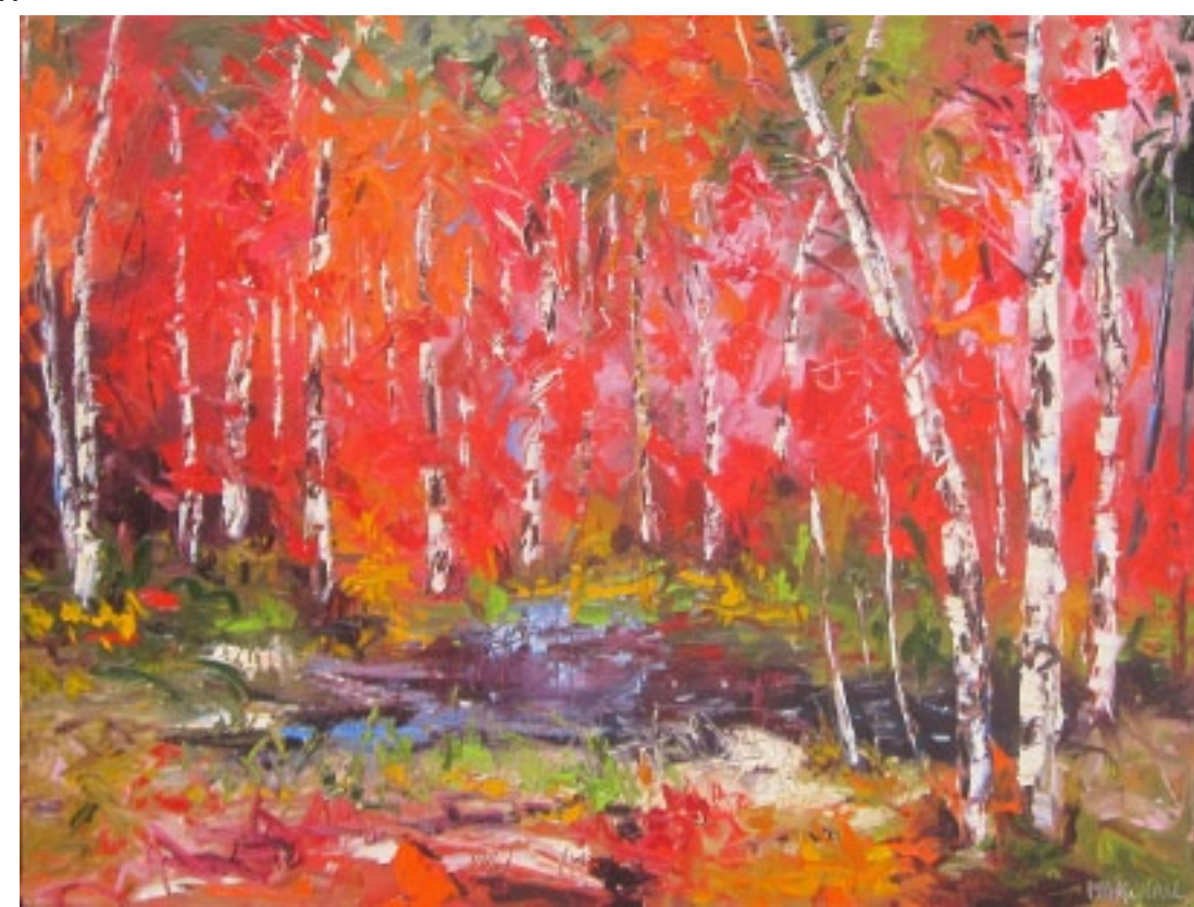
Red reflection :: 30 x 40 in