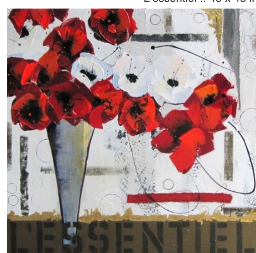
L'essentiel :: 48 x 48 in