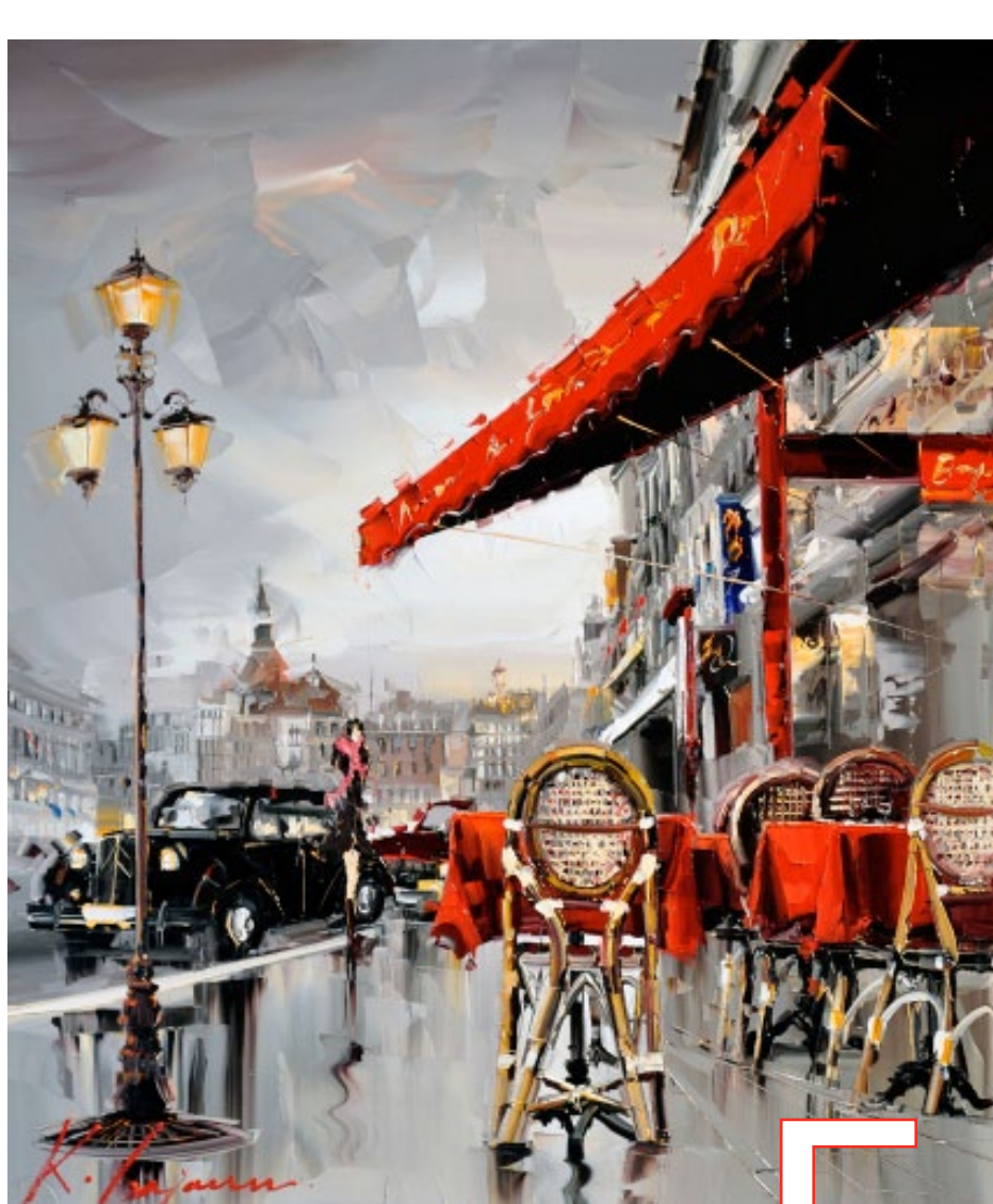
Gajoum :: Bonjour Trouville :: 36 x 30 in