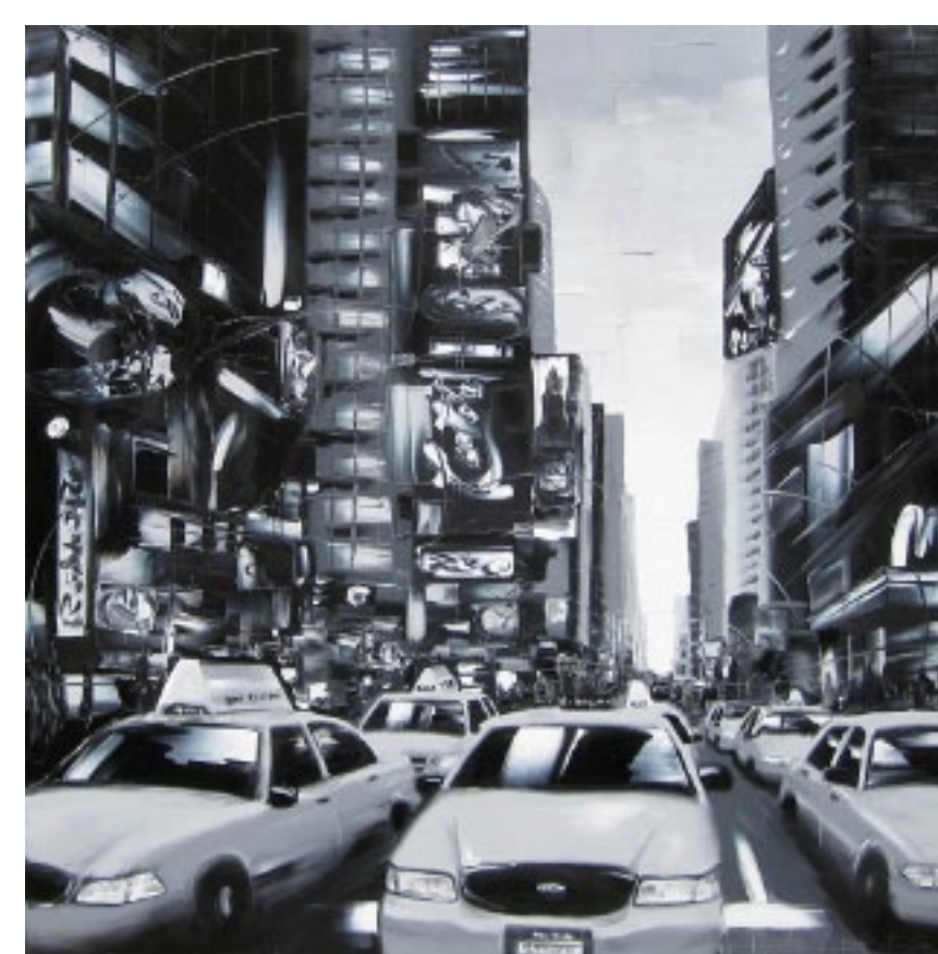
Blouin :: Welcome to NY :: 48 x 48 in