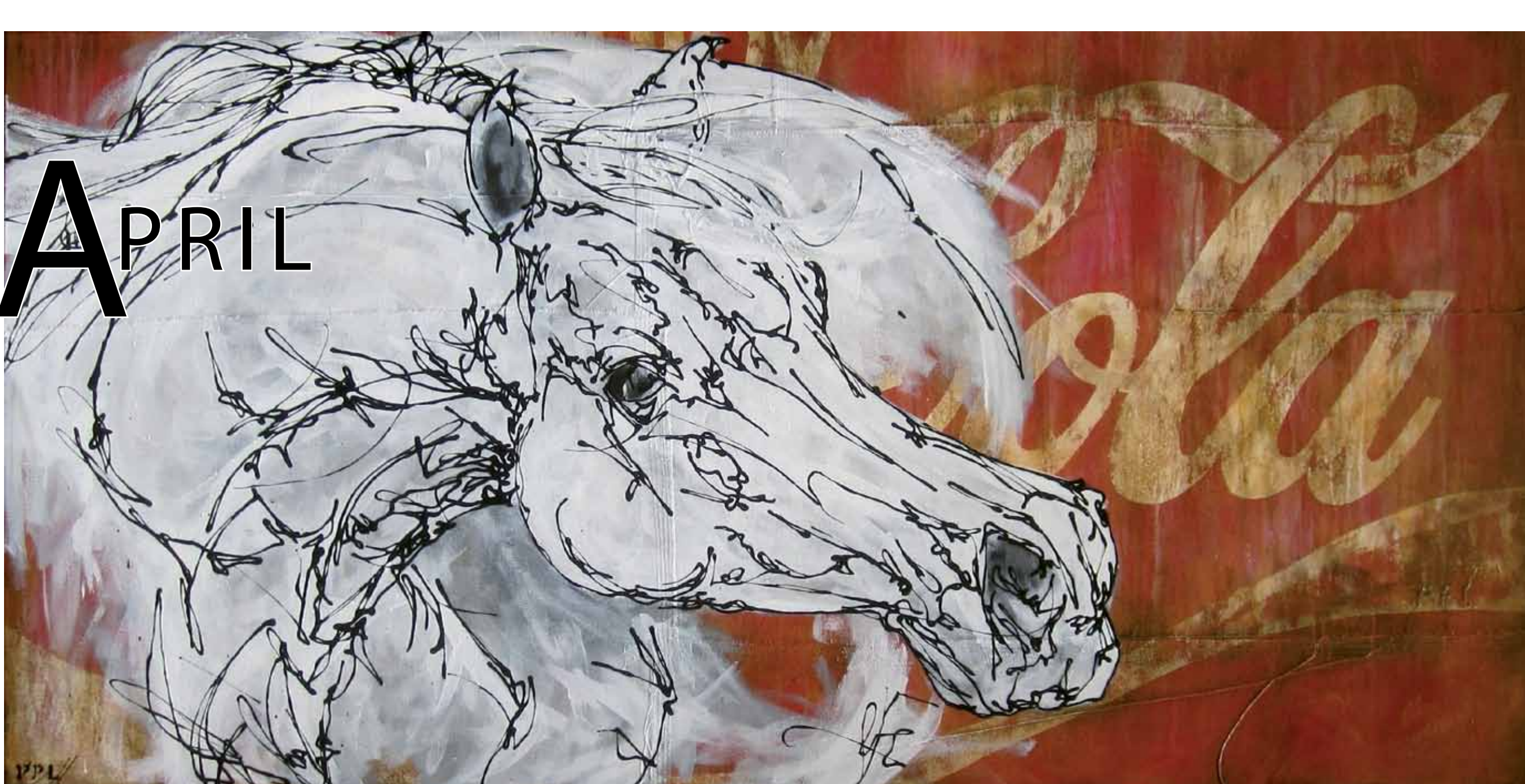
Larochelle :: Classic (36x72)