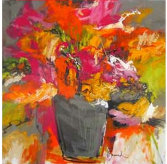
Our favorites : Doris Savard Colors of the wind (48x48)