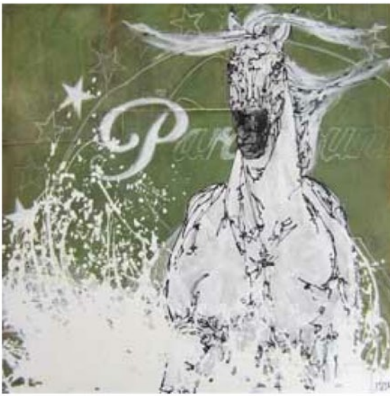
Our favorites : Sébastien Larochelle L'Élu de Neptune (48x48)