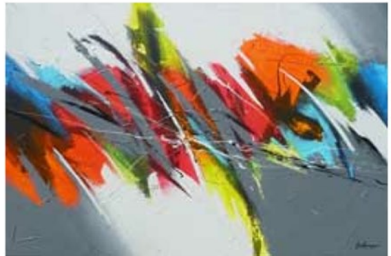
Our favorites : Pierre Bellemare Wake up (48x72)