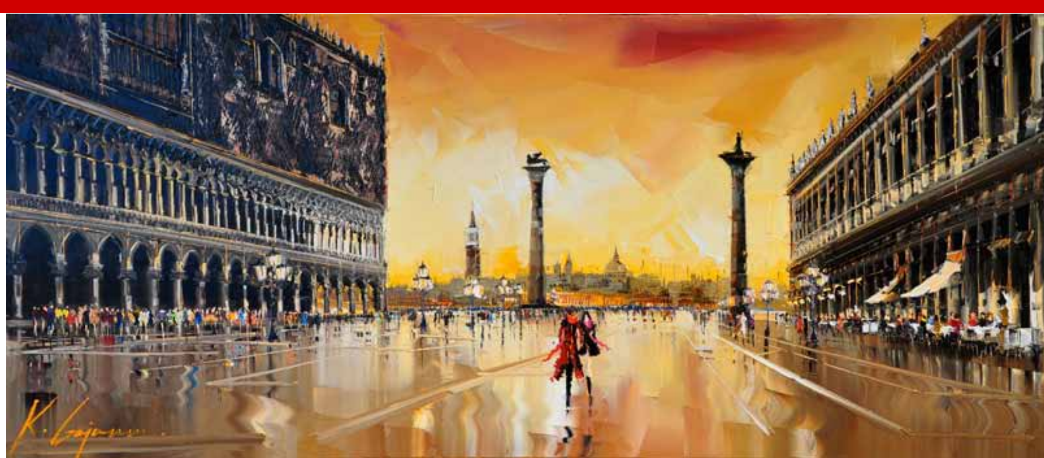
Kal Gajourm :: Venetian Sunset (30 x 70 in)