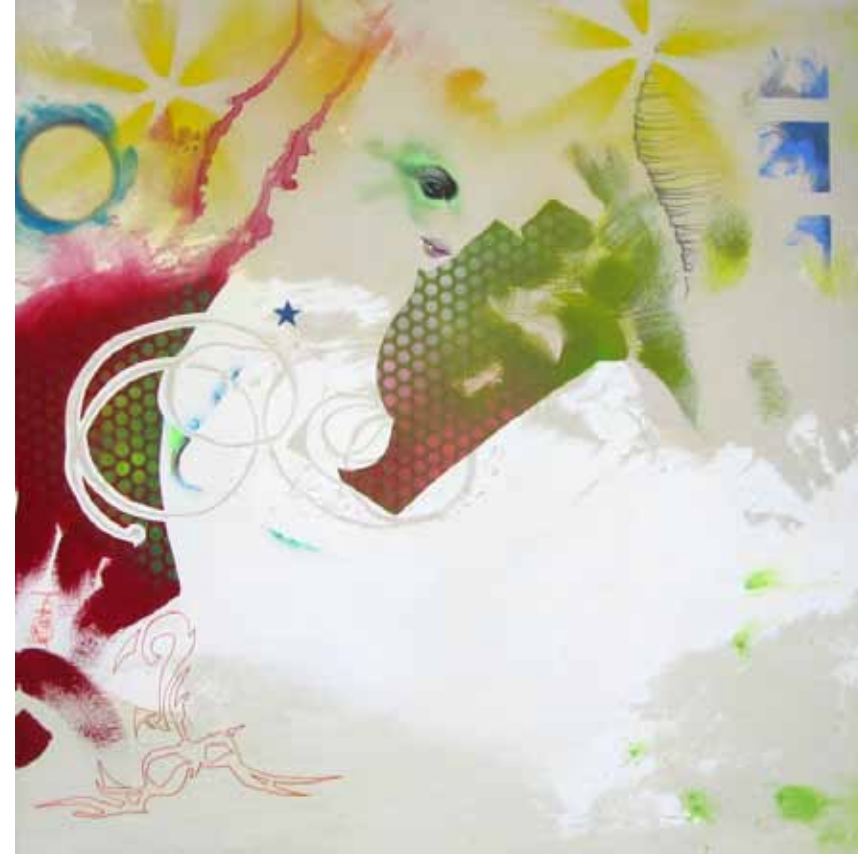
Jardin de Bengale :: 36 x 36 in