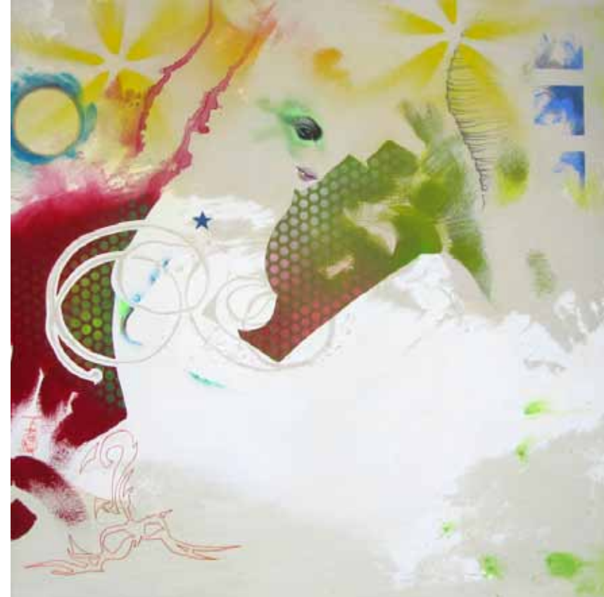
Jardin de Bengale :: 36 x 36 in