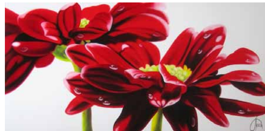
Broderie :: 30 x 60 in