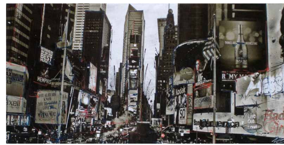
Behind :: 24 x 48 in