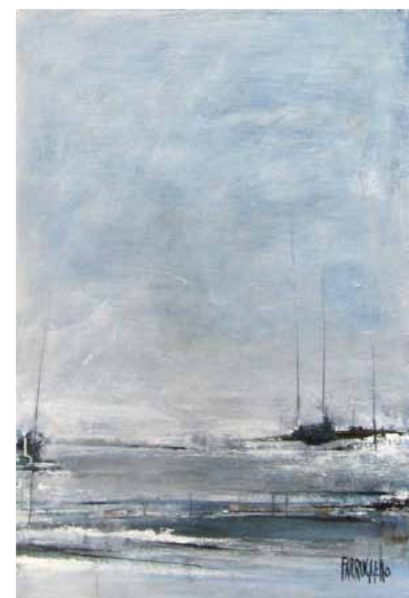
Marine 3 :: 36 x 24 in