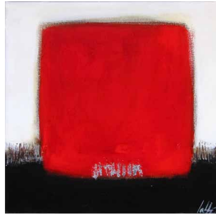
Passion :: 12 x 12 in