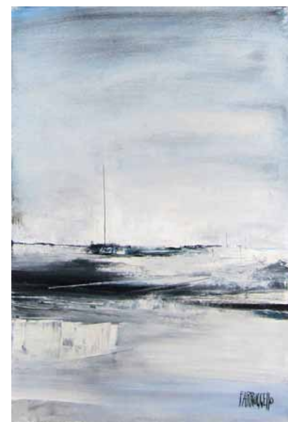
Marine 2 :: 36 x 24 in