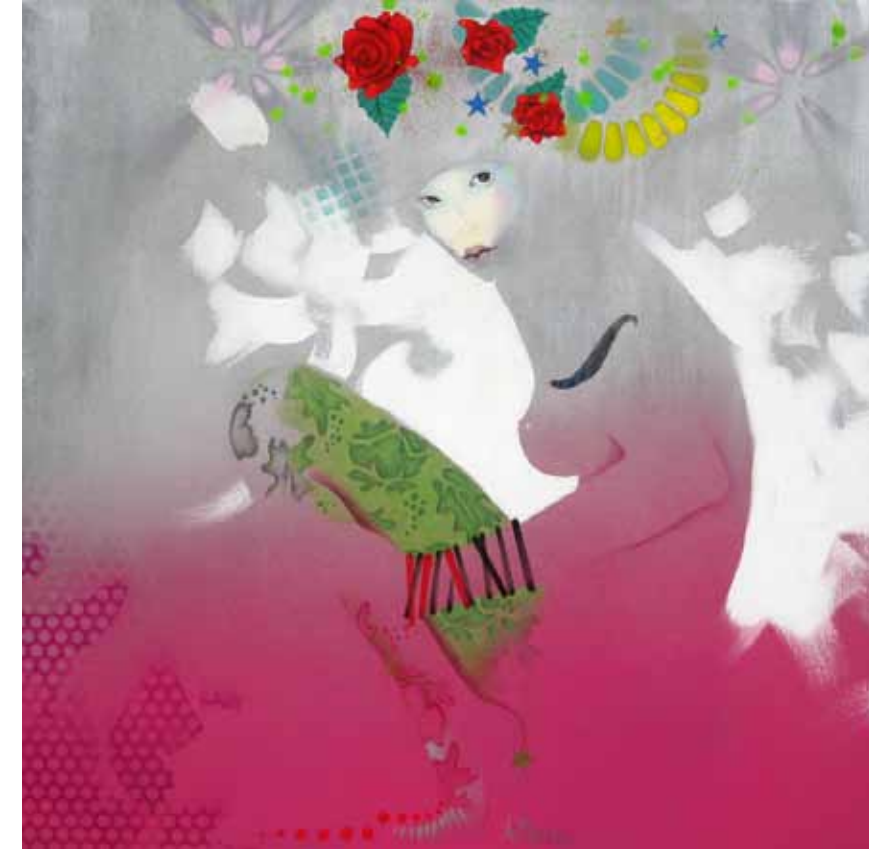
Bal mesure :: 36 x 36 in