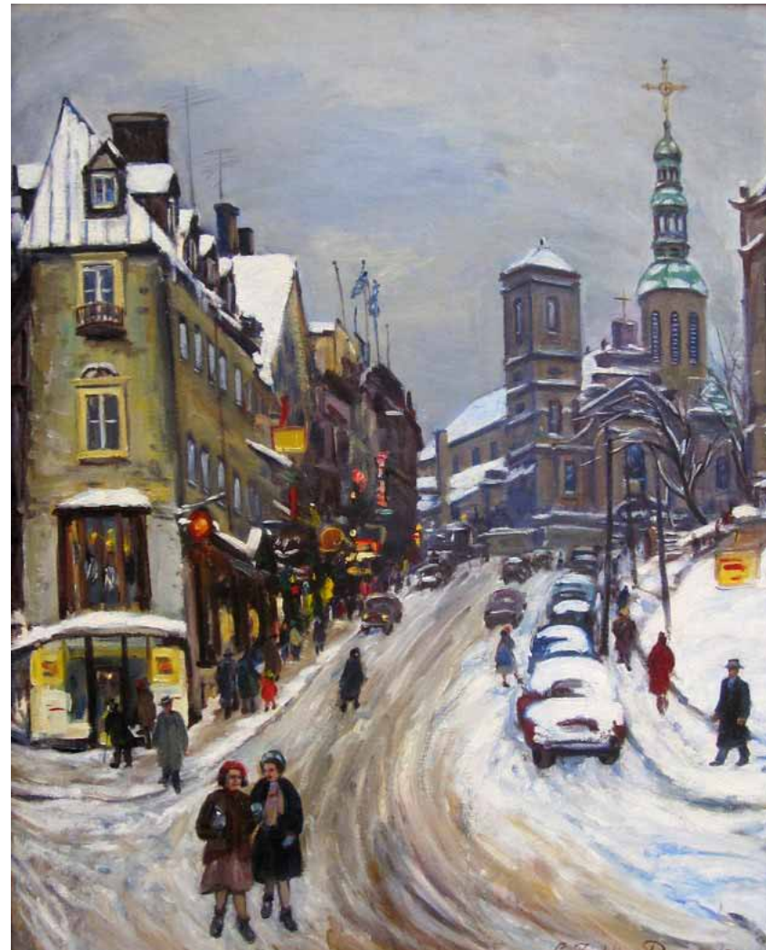
Lionel Fielding Downes :: Untitled :: 28 x 22 in