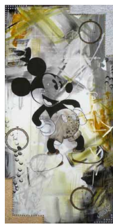
Le temps qui passe :: 72x36 in