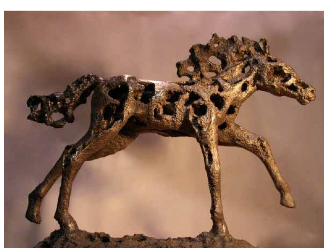
Exploration hippique 12 :: 26 x 20 x 9 in