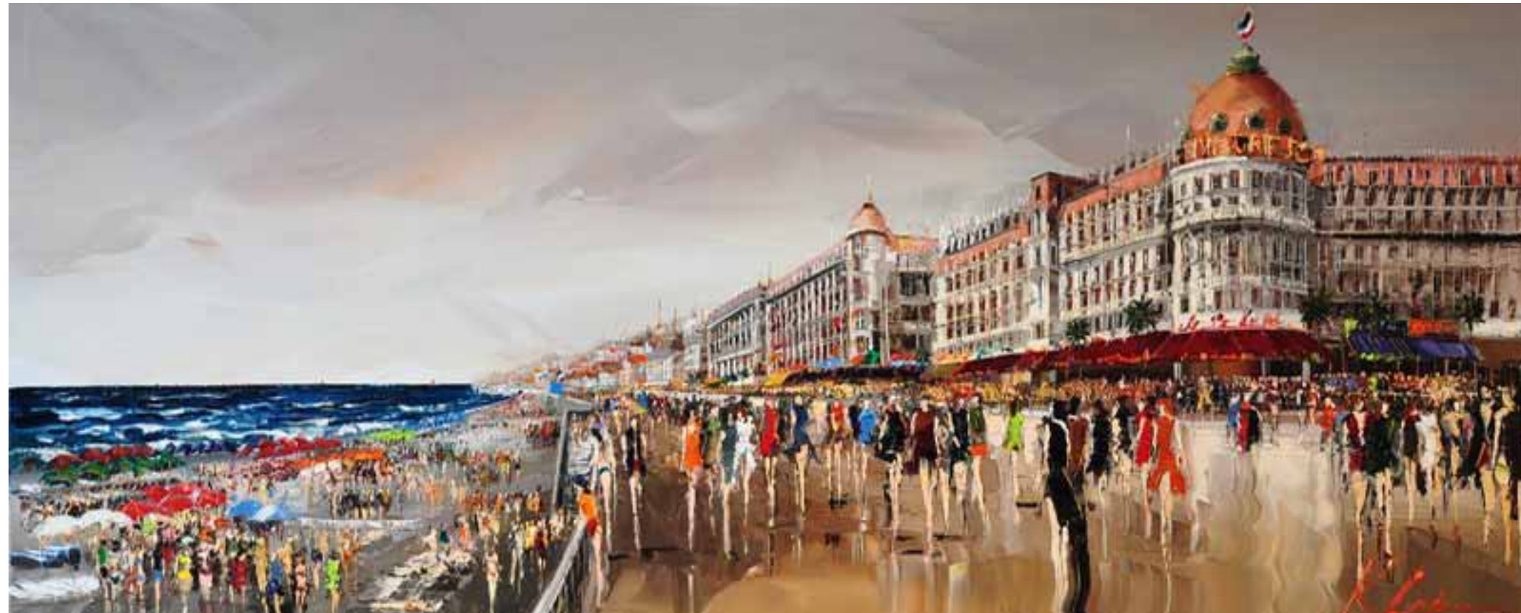
Gajoum :: French riviera :: 30 x 70 in

The painter Kal Gajoum was present at the opening of its new exhibition which takes place from June 4 to July 4 at the Beauchamp Art Gallery of Toronto.