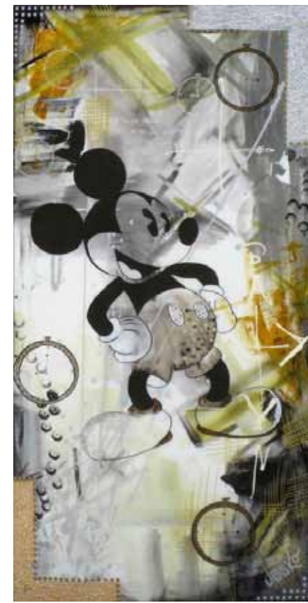
Le temps qui passe :: 72x36 in