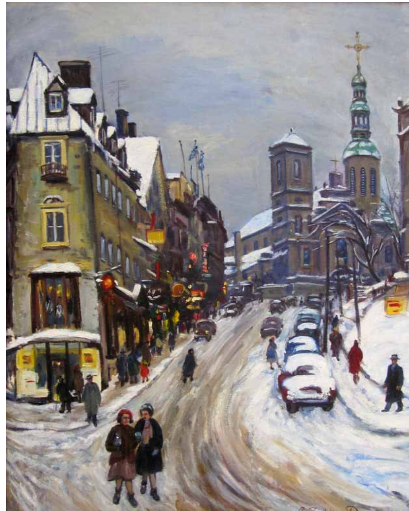
Lionel Fielding Downes :: Untitled :: 28 x 22 in