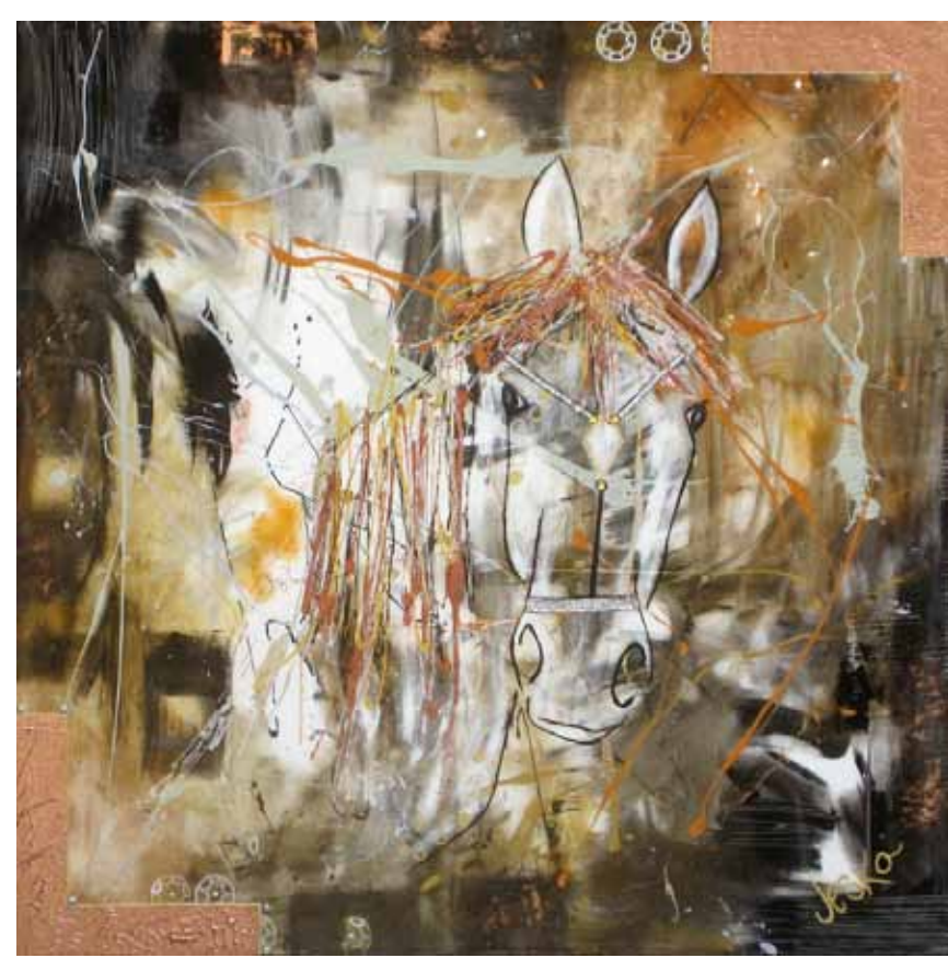
Du-Elle :: 48x48 in