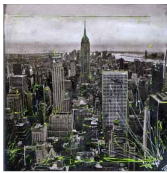
Underground :: 40x40 in