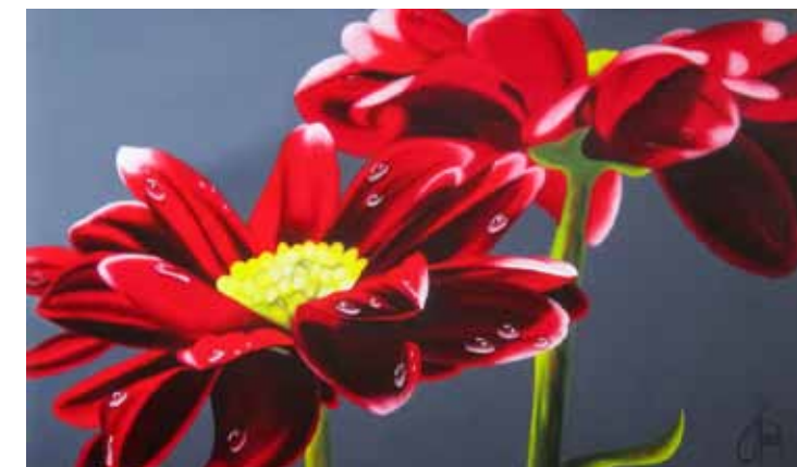
Jumelle :: 36 x 60 in