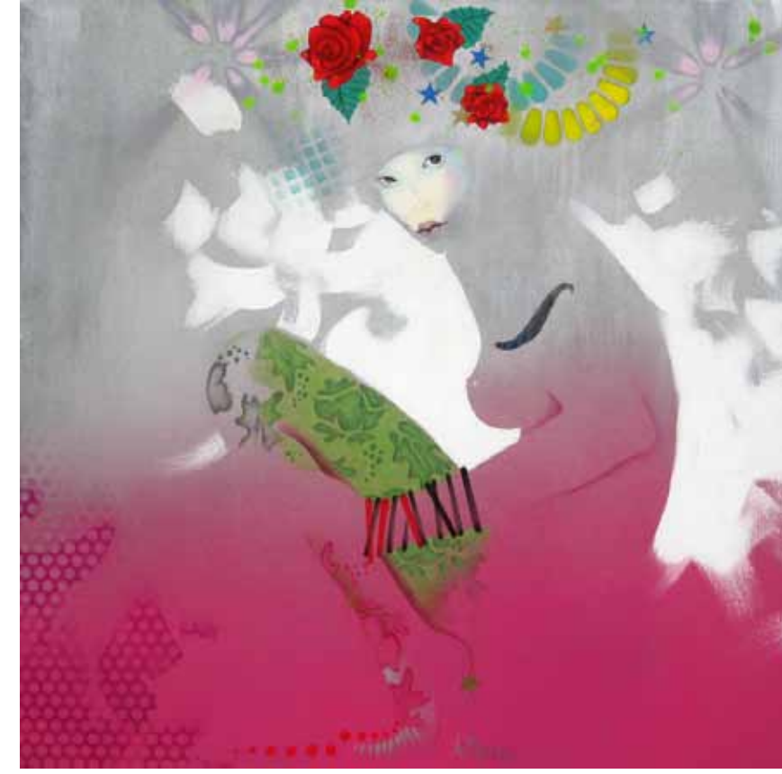
Bal mesure :: 36 x 36 in