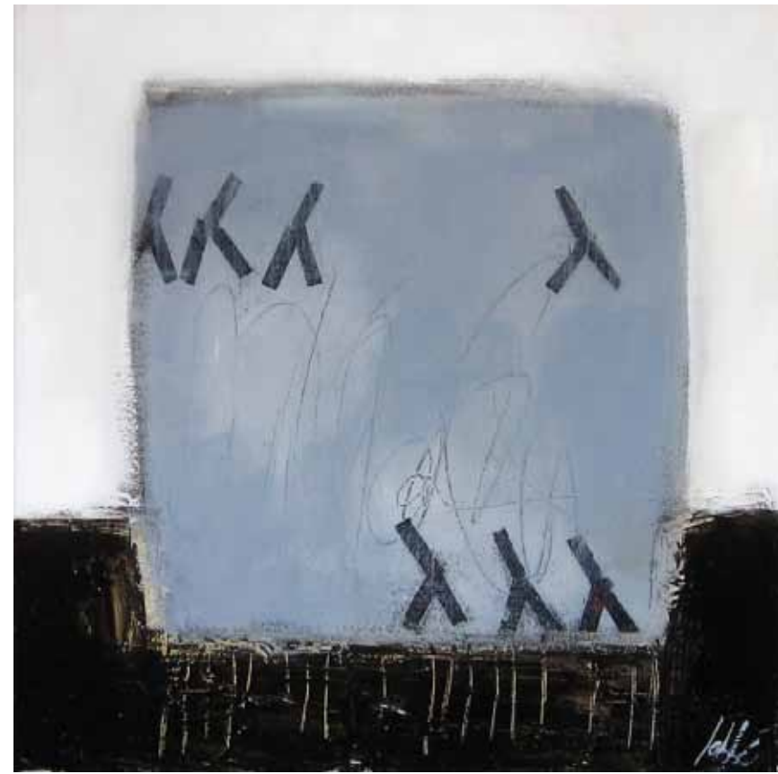
Nouvelle avenue :: 12 x 12 in