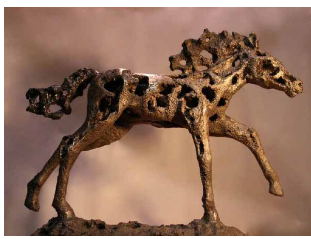
Exploration hippique 12 :: 26 x 20 x 9 in