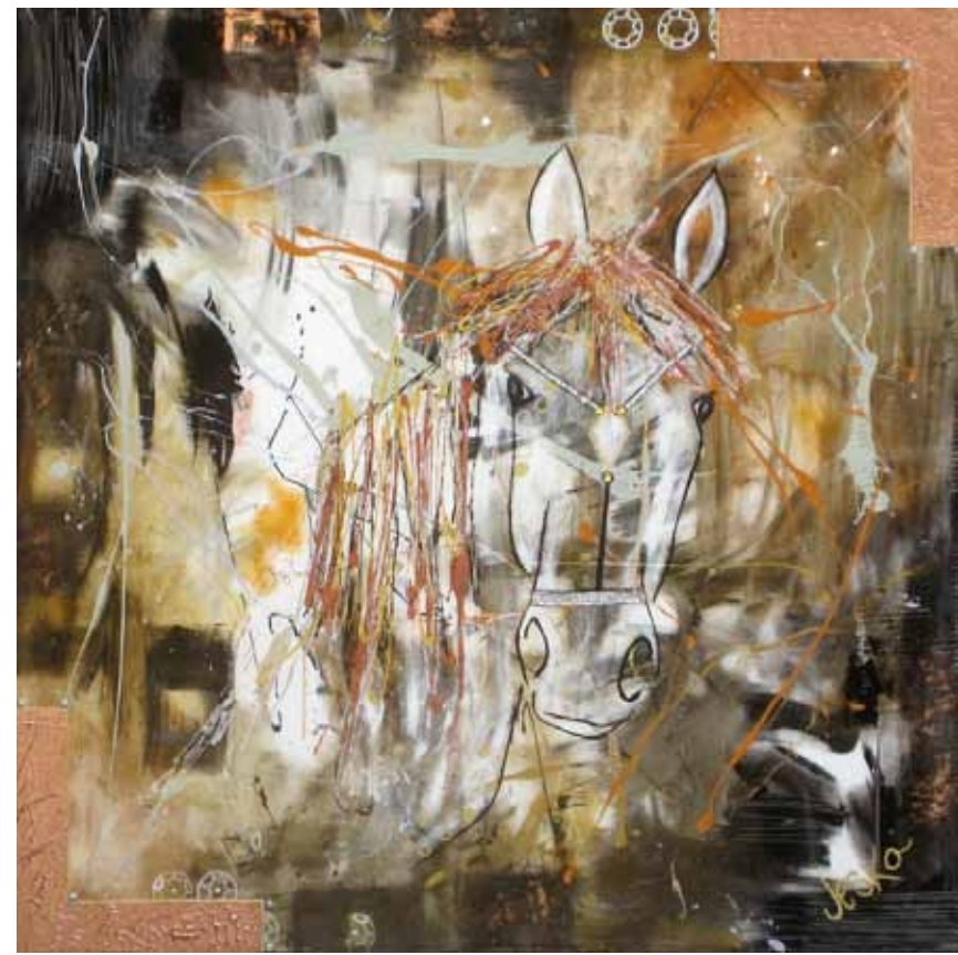
Du-Elle :: 48x48 in